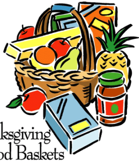
Thanksgiving Food Baskets